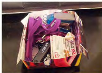
To store stuff.

HOPE YOU ENJOYED & HAVE A GREAT SEMESTER!