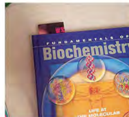
As a handy-dandy bookmark.