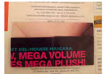
Or even as a ruler.